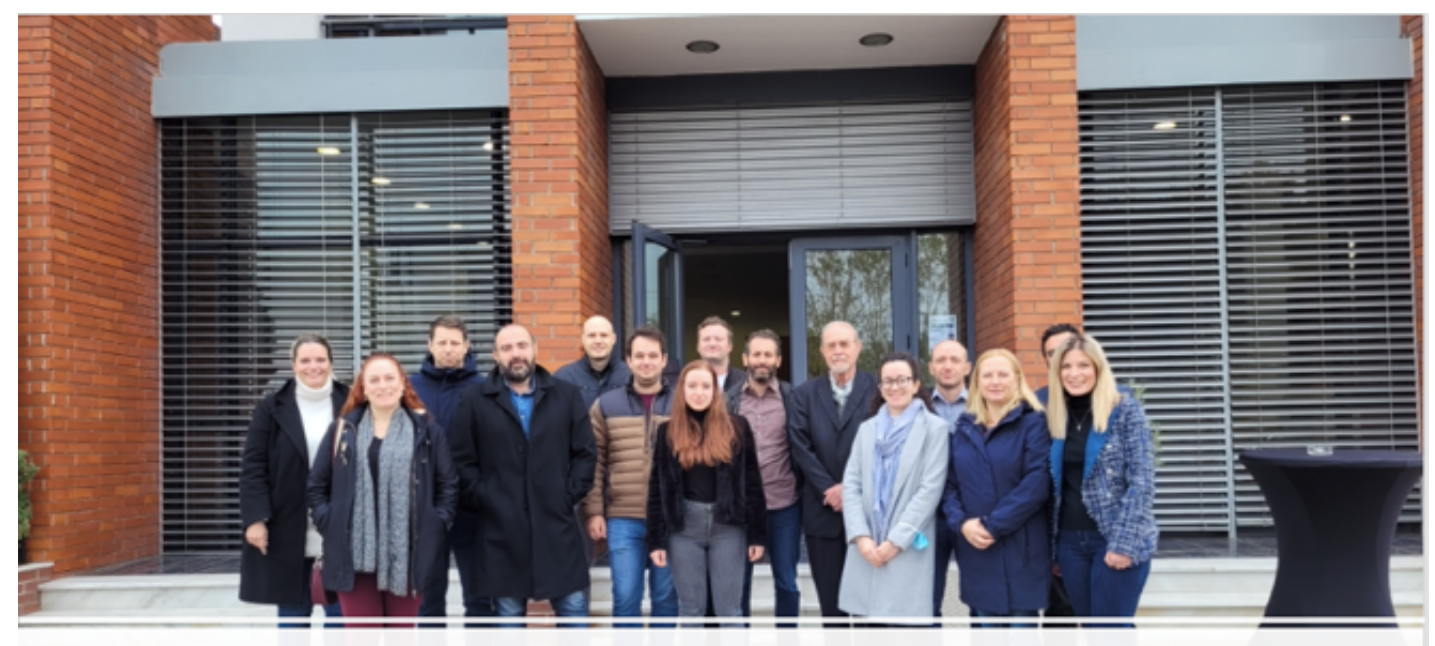
3rd Plenary Meeting in Thessaloniki, Greece, hosted by CERTH